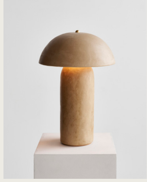
Tera Lamp Lime Plaster shown in Beige Size L