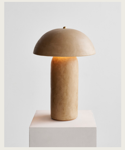
Tera Lamp Lime Plaster shown in Beige Size L