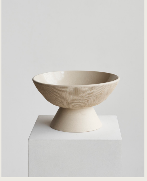
Dune Vessel 01 in Stone Size L