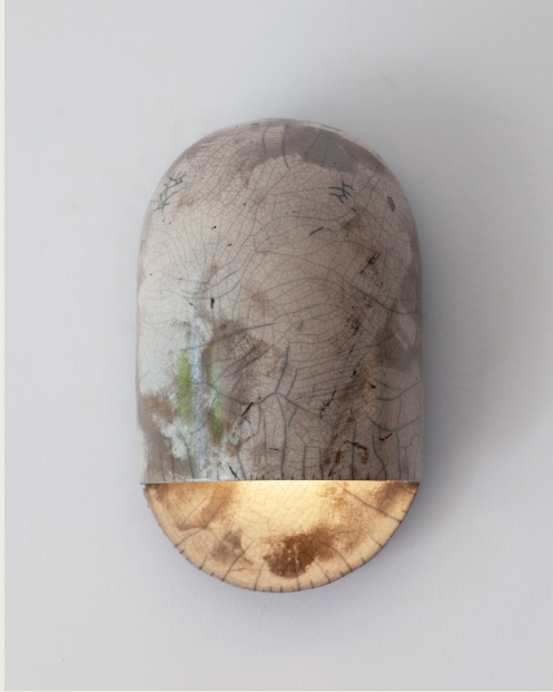
Tera Sconce shown in White Crackle Raku