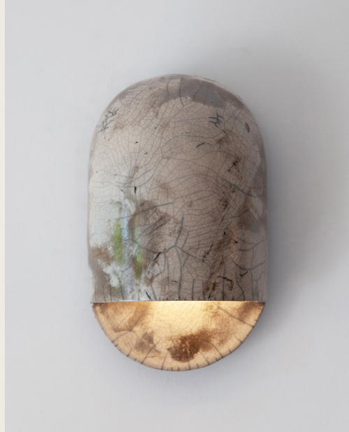
Tera Sconce shown in White Crackle Raku